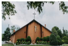
HOLY NAME OF JESUS